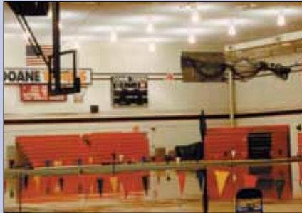
DOANE COLLEGE CRETE, NE