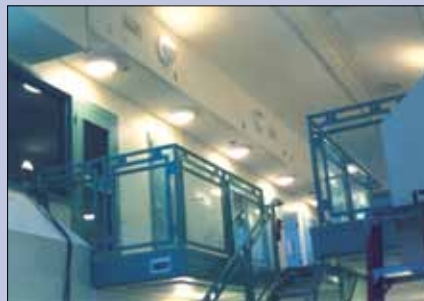
MAPLE LANE JUVENILE CENTER CENTRALIA, WA