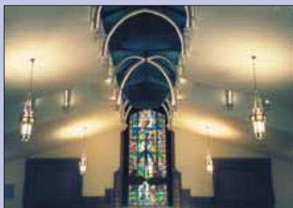
ST. JOAN OF ARC PHOENIX, AZ